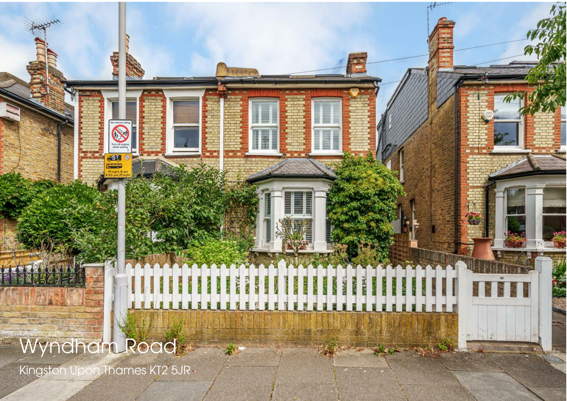
Wyndham Road Kingston Upon Thames KT2 5JR

34 Richmond Road Kingston upon Thames Surrey KT2 5ED www.gibsonlane.co.uk Tel: 020 8546 5444